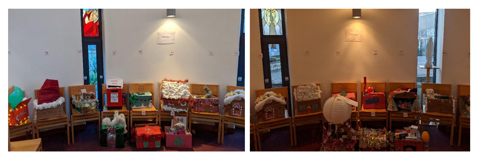
The Students decorated Hampers and filled them with generous gifts to go to the elderly residents at Friary Court . These were then displayed in the Chapel near each of their House Stained glass windows