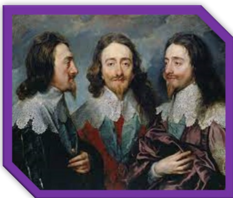
Charles I in three positions Anthony van Dyck 1635

This is a linear A Level with all exams being taken at the end of Year 13. Coursework is worth 20% of the qualification.