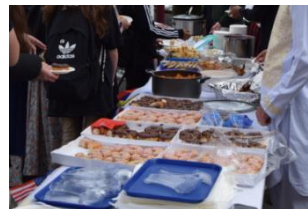
Sixth Form Leadership Team

Culture week was a huge success, with the school taking part in form activities such as creating posters and competing in the Interhouse Music Quiz. We ended the week with the Great Get Together, celebrating the memory of Jo Cox, and her legacy, everyone dressed in cultural clothes and enjoyed foods from around the world. We would like to thank everyone involved in